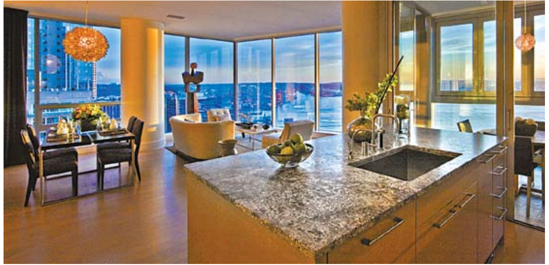
Model homes at Fifteen Twenty-One Second Avenue will be open next weekend, showcasing protected views of Elliott Bay.